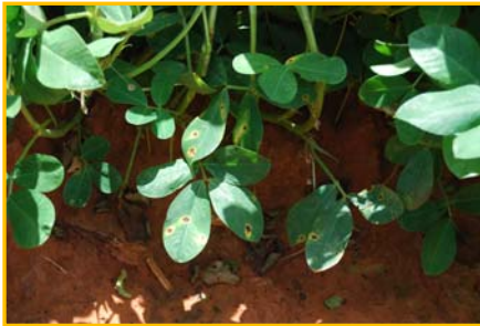
Early leaf spot lesions in lower peanut canopy.

Georgia, Coastal Plain Experiment Station in Tifton indicates that several fungicide options are available for post-infection situations.