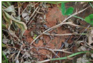
Bleached and shredded stems typical of Sclerotinia blight.

(sclerotia) are characteristics of the disease. The use of partially resistant cultivars (such as Tamrun OL07) is beneficial in managing this disease.