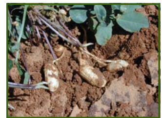
PEANUT PEGS & PODS

As always if you have any additional questions or issues with this year's crop feel free to contact me or one of the other members of the AgriLife Extension Peanut Team. tbaughma@ag.tamu.edu or 940.552.9941 ext. 233.