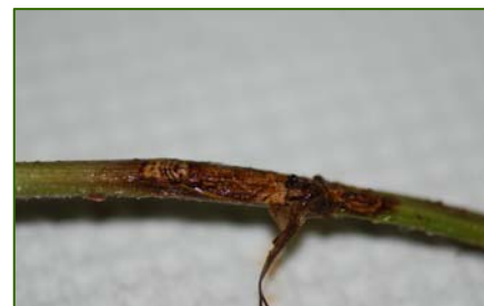
Rhizoctonia limb rot lesion on a lower branch.

Rhizoctonia solani is also capable of infecting peanut limbs that are in contact with the soil. The resulting disease, referred to as limb rot, can be easily diagnosed by the bulls-eye-shaped lesion on the limb.