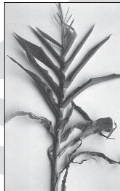
Drought stressed corn rolls leaves mid-morning to late afternoon. Progressive leaf loss proceeds from bottom to top of plant.

Utilizing Damaged Plants. With pastures fully used-up and dormant from high temperatures, livestock owners often consider salvaging some feed value from ruined stands of corn. The growth state of the corn may determine the option being considered. Fields of corn damaged by drought may have corn in all stages of development. Emergence is often uneven, and the parts of the field with better soil moisture may be the only plants to achieve normal plant height or to produce an ear. Early in drought, leaves begin to yellow and die back from the blade tip