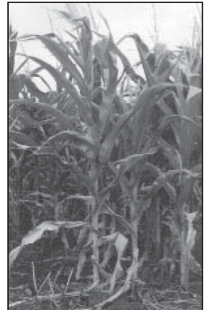
Unable to supply enough carbohydrate to combine with nitrates from soil-applied fertilizers, corn plants accumulate nitrogen in the lower stalk until night temperatures cool enough for photosynthesis proceed.

The nitrate ion ( \text{NO}_3 ) when ingested, is reduced to the nitrite ion ( \text{NO}_2 ), which is readily absorbed into