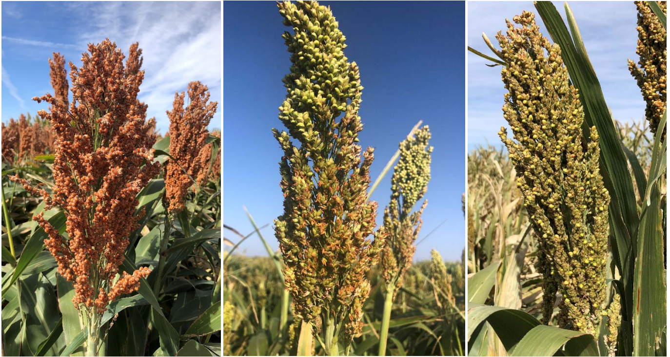
Figure 2. Examples of varying pollination in the trial. All plots were evaluated for pollination with scored from 1 to 3 as represented by images from left to right. 1: \geq 90\% pollination (Good), 2: 50-90% pollination (Fair), 3: \leq 90\% pollination