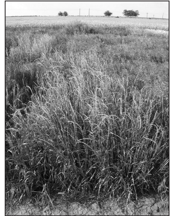
Figure 1. Mature ryegrass in Texas.

One of the most effective methods for managing resistant ryegrass populations is crop rotation. Rotating to a summer crop allows you to use non-selective herbicides and tillage in the winter. Timely control of ryegrass infestations in winter-fallow fields can greatly reduce ryegrass seed in the soil. Rotating to summer crops also allows you to use additional herbicide modes of action to control any ryegrass that survives winter control measures.