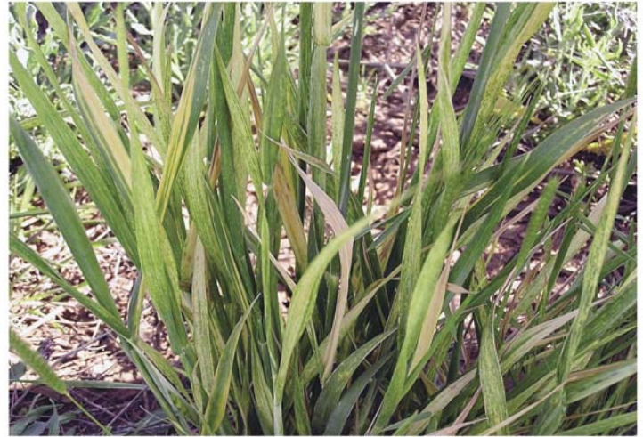
Figure 2. Wheat plant infected with Wheat Streak Mosaic Virus and High Plains Virus.

Under favorable conditions, wheat curl mites have tremendous reproductive capability, enabling large populations to build. The mite is most active during warm weather, with temperatures of 75-80 degrees F optimum for reproduction.