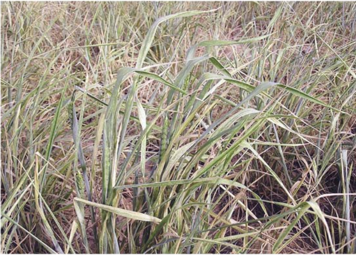
Figure 3. Wheat plant infected with Wheat Streak Mosaic Virus and High Plains Virus.