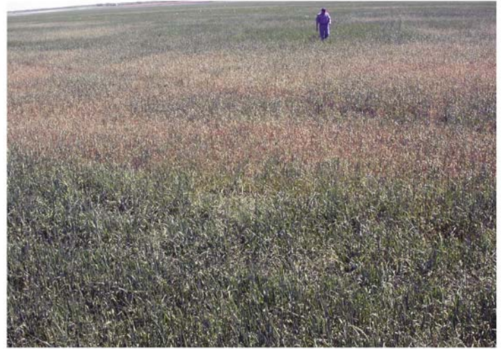
Figure 4. Wheat field infected with Wheat Streak Mosaic Virus and High Plains Virus.

Wheat varieties vary in susceptibility to WSMV; however, resistance levels seldom approach 50 percent. No wheat variety has enough WSMV resistance to endure high virus pressure. Plant a wheat variety with partial resistance to WSMV as part of an overall management plan, but only in combination with destruction of summer grasses and volunteer wheat. Currently, there is no known resistance to HPV in wheat.